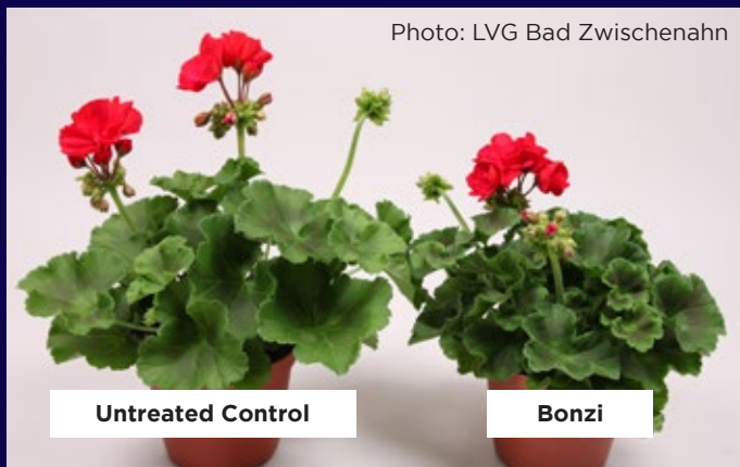
Growth control with Bonzi Plant Growth Regulator Spray Treatment on Calliope Dark Red Geraniums

Bonzi inhibits the production of gibberellins at an early stage of the process, resulting in shorter internodes and more controlled growth. This way Bonzi can manage the growth and shape of a plant which results in a more compact and firm plant that fits with the requirements of the market.