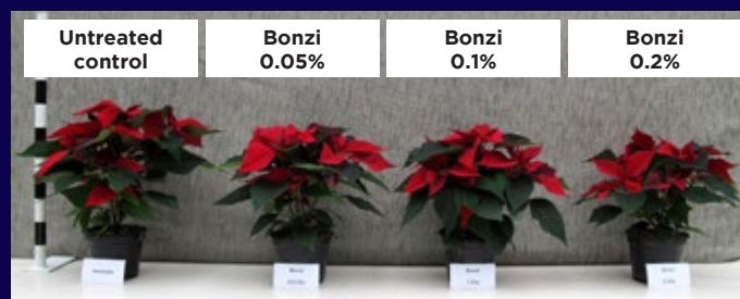
The effect of Bonzi in Poinsettia at different dose rates